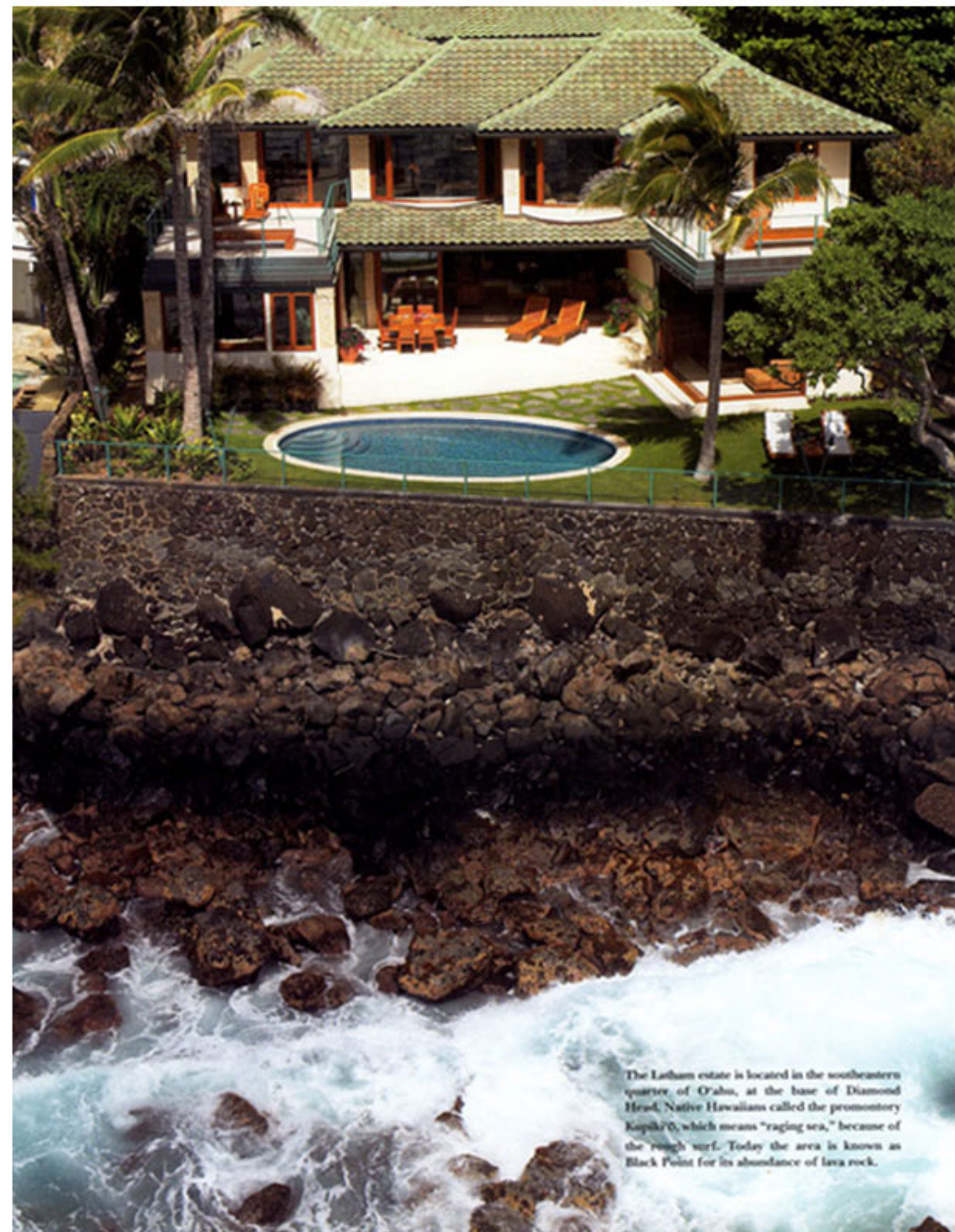
The Latham estate is located in the southeastern quarter of Oahu, at the base of Diamond Head. Native Hawaiians called the promontory Kopikō , which means "raging sea," because of the rough surf. Today the area is known as Black Point for its abundance of lava rock.