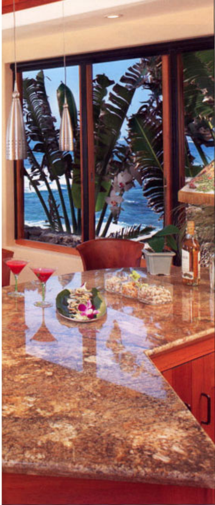
ABOVE: The home's oceanfront wing includes the family room, living room, and study downstairs.

O'ahu, at the base of Diamond Head. Native Hawaiians called the promontory Kupiki'ō, which means "raging sea," because of the rough surf. Today the area is known as Black Point for its abundance of lava rock. It's a favorite of divers and surfers. When Lancor first inspected the site, he found a narrow, sloping lot on rocky ground that offered incredible views of Diamond Head to the west, the endless ocean horizon to the south, and the ever-changing South Pacific sky above.